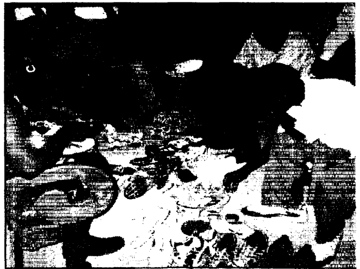
Natives of a Haitian village sort through donated shoes