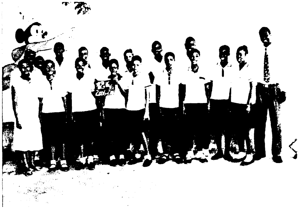
12th Grade Students (2006-2007)