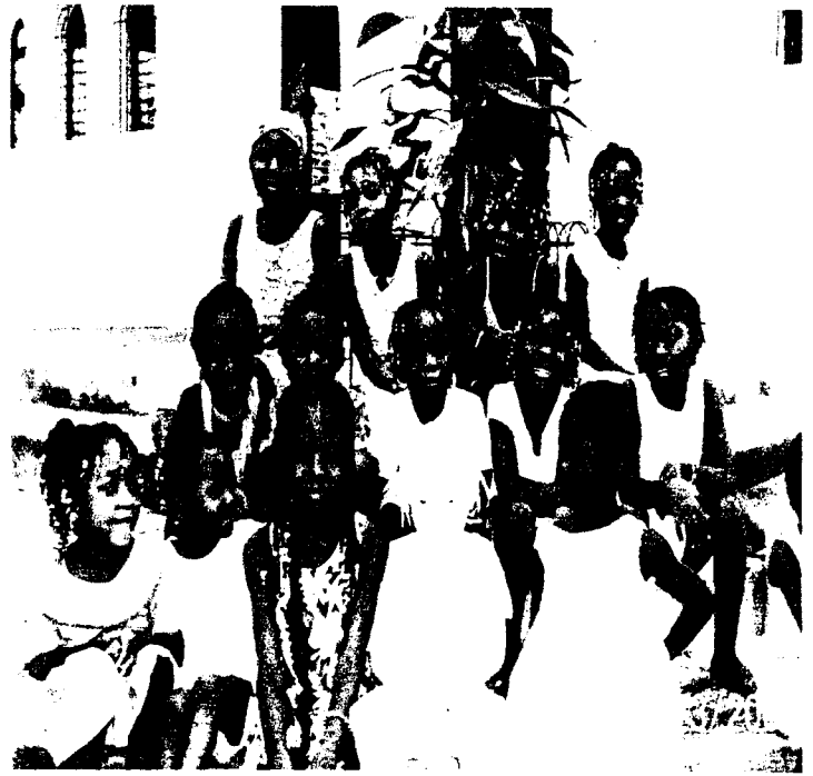
Children from the orphanage in Haiti

~ Missionary to Haiti & the Dominican Republic