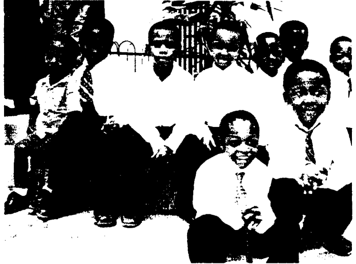
Young Haiti School Children

I have received the 280 catechisms donated by Lutheran Heritage Foundation, which is very good because we