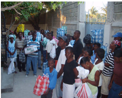
People Receiving Food